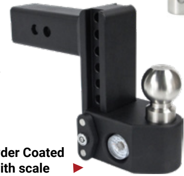
▶ Black Powder Coated Steel with scale