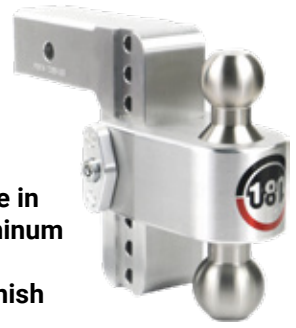
▶ Stainless Steel Tow Balls

Built-in Gauge not available w/ 180 Hitch