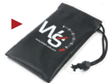
TOW BALL STORAGE BAG ▶ (WS18)