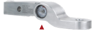
▶ 2" Drop with scale

***Available in brushed aluminum & black cerakote finish