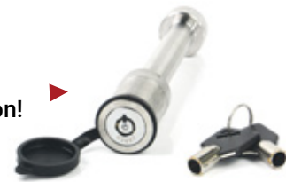
▶ Optional keyed alike Hitch Locking Pin add on!