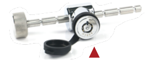
▶ ADJUSTABLE TRAILER COUPLER LOCK (WS11)