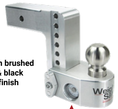
▶ Brushed Aluminum with scale

***Available in brushed aluminum & black cerakote finish