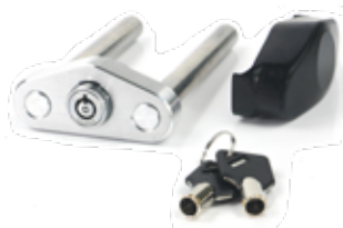
◀ Dual Pin Key Lock Assembly with keys to secure product and a dust lock cover. (included with both Weigh Safe & 180 Drop Hitches)