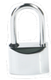
◀ PADLOCK (WS12)

All of our Weigh Safe locks can be keyed alike to your Weigh Safe hitch so that you can have one key for everything!