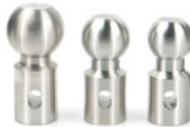
◀ Weigh Safe Drop Hitch: Your choice of (2) stainless steel tow balls; either a 1-7/8" & 2" or a 2" & 2-5/16" tow balls.