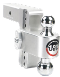
▶ Chrome-Plated Steel Tow Balls

***Available in brushed aluminum & black cerakote finish